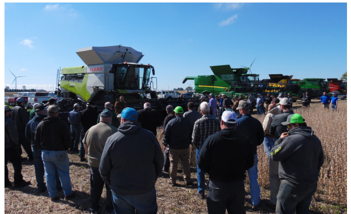
Participants at the 2021 Soybean Harvest Equipment Field Day.

Follow-up evaluations (measuring what the participants did instead of what they intended to do) showed that 81 producers implemented the new information they learned in 2021 and 52 producers actually earned or saved additional money by implementing the new information. The average amount of added income reported was $9.46 per acre applied to 38,315 acres, producing an actual financial impact of $362,642 in 2021.