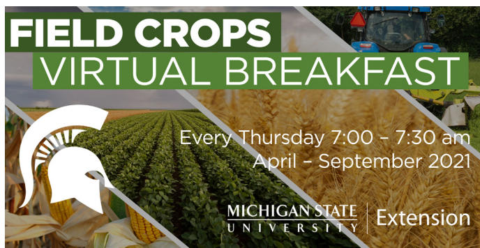
The Field Crops Virtual Breakfast Series is a free weekly webinar for farmers, agribusiness personnel and others interested in agriculture held Thursday mornings from 7 a.m. to 8 a.m.

The 2021 Field Crops Virtual Breakfast Series was a weekly webinar for farmers, agribusiness personnel and others interested in agriculture. The series, which ran for 26 weeks, was conducted during the growing season with a focus on field crop and pest management, soil health, soil management, cover crops and financial management. Each week, MSU Extension specialists and educators as well as other guests provided brief presentations on various topics followed by a detailed weather analysis for the state. Each session concluded with a 30-minute Q&A segment. Participants were encouraged to interact with MSU Extension specialists and educators to get answers for their questions on field crop production and management topics. Each week, restricted use pesticide and certified crop advisor recertification credits were available to participants. The series was live streamed via Zoom and on Facebook for easy accessibility. Recordings were available for later viewing with closed captioning on the MSU Extension Field Crops website and outlets such as YouTube, Facebook, Spotify and iTunes.